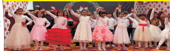
Performance - Sapno Ki Udaan