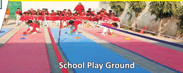
School Play Ground